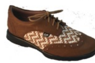
Charlie Butterscotch Weave