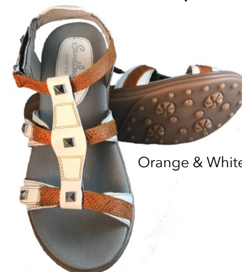
Orange & White