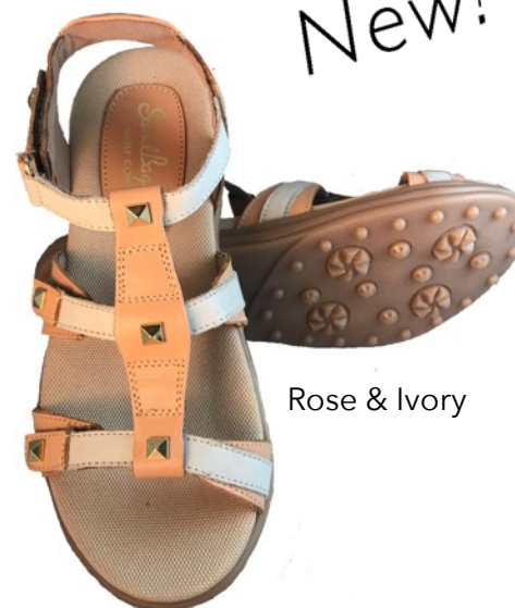
Rose & Ivory