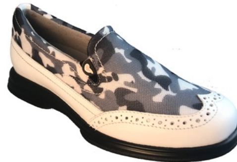
Gray Camo & White