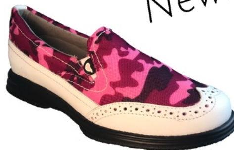
Pink Camo & White