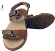
Lola Chocolate Treat